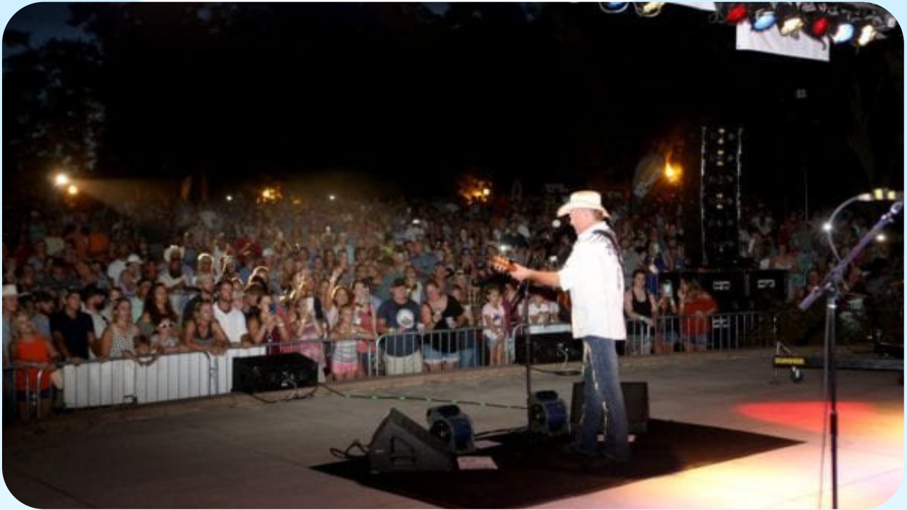
Country Superstar, Tracy Lawrence in concert at the Hanahan Amphitheater.